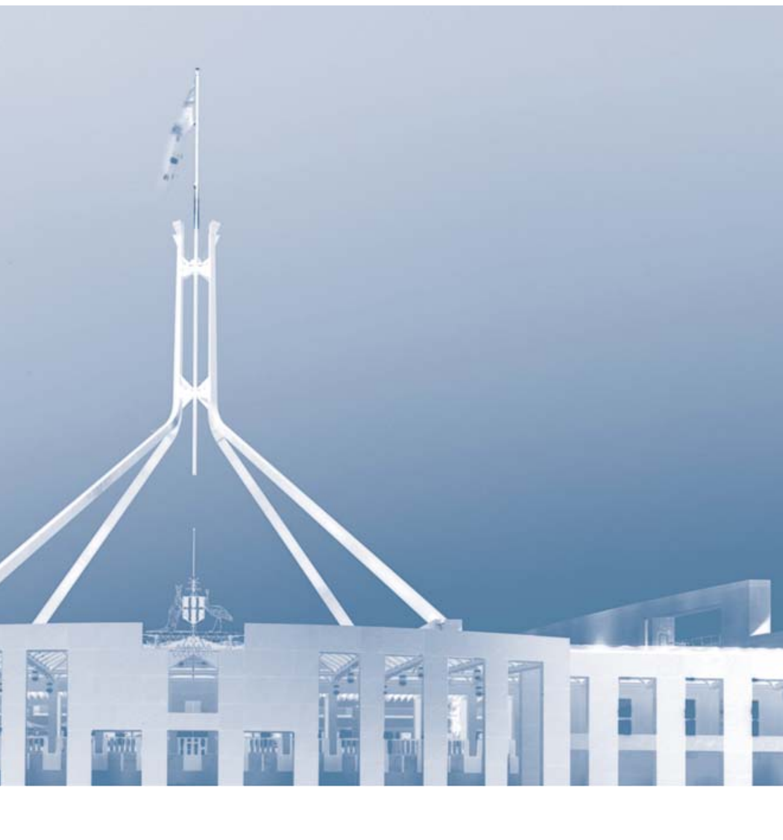
Parliamentary Budget Office work plan 2015–16